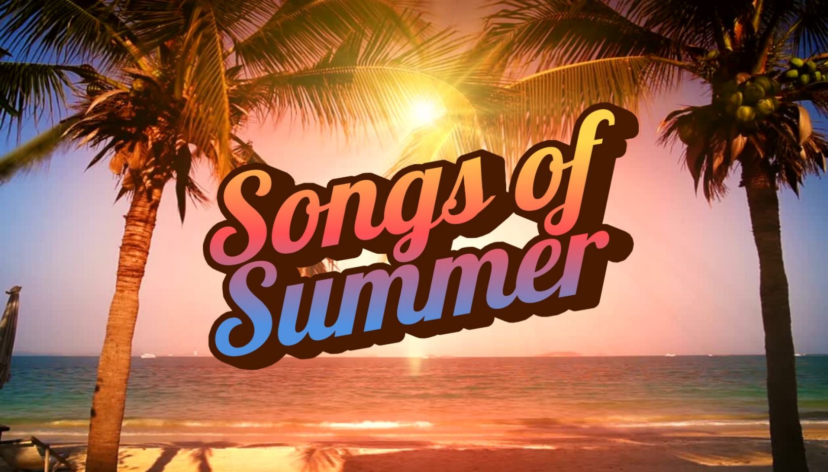
Songs of Summer Psalm 8